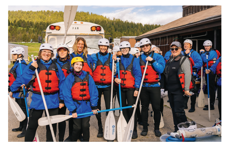
White water rafting with Big Sky Adventure Camp Families

National Park. A 7-day camping adventure included sightseeing in the park, white water rafting, Old Faithful, hot springs and a night in tipis. We also had the opportunity for a guided boat tour on Yellowstone Lake, the largest lake in the U.S. above 7.000ft.