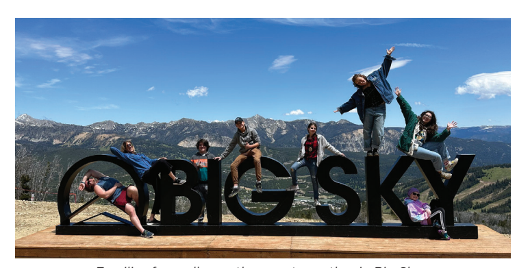
Families from all over the country gather in Big Sky

These camps could not happen with the ongoing support of our incredible community. We are grateful for the food, activities, and lodging accommodations donated by generous and compassionate local businesses and organizaitons. Without supporters like you, these no cost, amazing opportunities would not be possible for young people impacted by cancer. Thank you for your ongoing support of Eagle Mount and the Big Sky Kids program!