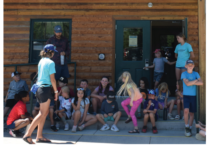
EXPLORE! Camp gathers at Story Mill Park

across our programming. It's our hope that this partnership continues and grows."