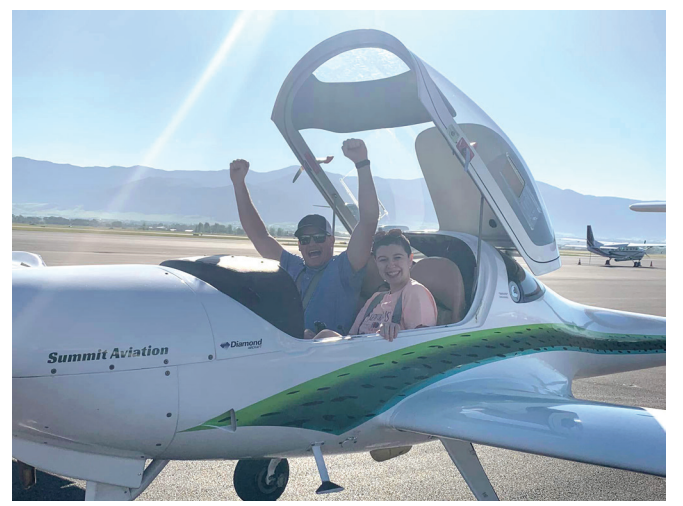
9th Annual Flight Camp with Summit Aviation

Ending our summer programming was the 24th wet and wild Young Adult Retreat (YAR). It rained, hailed and snowed during the week as 11 campers headed to Yellowstone