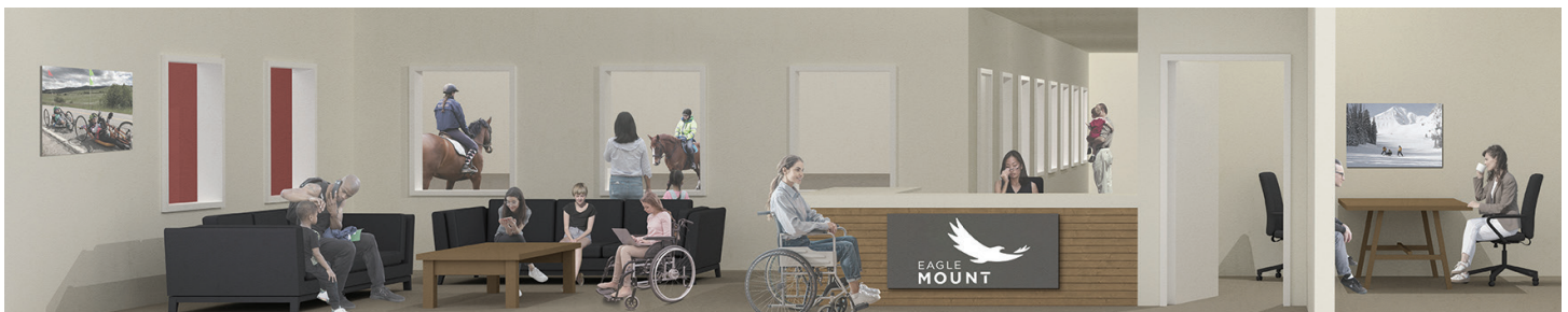
An architectural rendering of the Adaptive Horsemanship Education Centers' Lobby.

This Horsemanship Education Center expansion will also better support our year-round programming efforts. For example, a heated feed and tack room alongside an energy efficient mechanical room and the thoughtful design of this space will reduce our annual operating costs by an estimated $15k per year. We're excited to be embarking on this project and what the completion will mean for our community. The goal for this project is one million for Construction, equipment and establishing. As of May 15th, we have secured 50% of our funding and hope to break ground this fall. If you're interested in learning more and seeing our plan mock-ups, visit our website at eaglemount.org or call Kevin for a tour at 406-586-1781. We'd love to show you the plans personally.