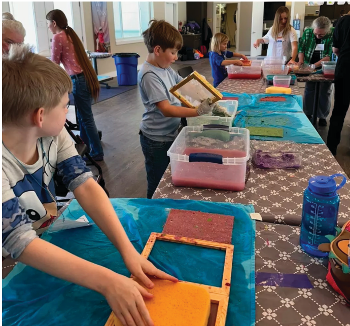
Making paper at All-Abilities Spring Break Art Camp.

Since January, Eagle Mount has been bringing people together each month through a new Arts program offering called the Creators Club. Designed to foster community among participants, families, volunteers, and staff, the club provides a space for all at Eagle Mount to try new crafts, develop their artistic skills, and connect with others through creativity.