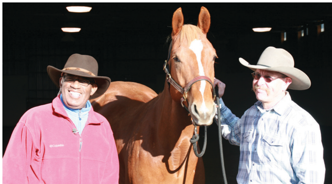
'Today Show 120'- Al Roker of NBC's Today Show visits Eagle Mount in June 2010 recognizing Eagle Mount as one of five small nonprofits throughout the country that work to improve their community.

Al Roker's visit is still talked about today by participants, volunteers, and staff who were present to receive the $1.23 million in donated items – from skis to one of Tom Brokaw's quarter horses (named RC!).