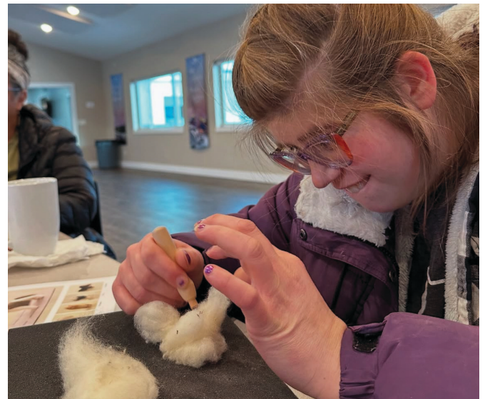
The Creators Club needle-felting workshop.