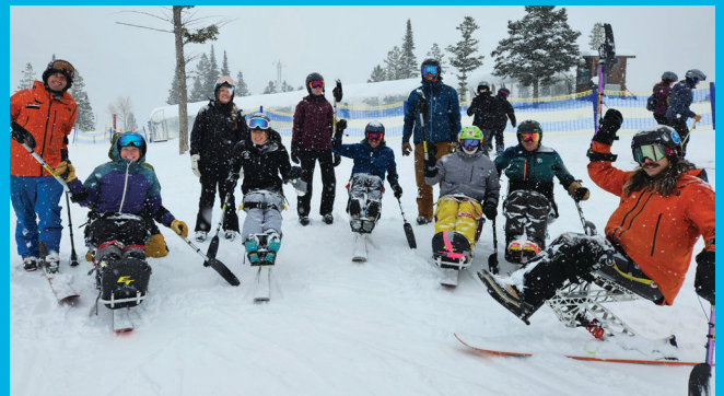
Snowsports volunteers, participants, and staff enjoying the snow.

As the snow begins to melt and we reflect on the past season, we want to extend our deepest gratitude to all of our incredible snowsports volunteers. Your dedication and hard work have made a profound impact on the lives of our participants, allowing them to experience the joy and freedom of snowsports. From early mornings on the slopes to the countless hours spent ensuring safety and fun, your efforts have created unforgettable memories for everyone involved. Your patience, enthusiasm, and unwavering support have helped our participants build confidence, develop new skills, and enjoy the beauty of winter. Thank you for being the heart and soul of our snowsports program! Your generosity and kindness make a world of difference, and we are deeply grateful for all that you do. Together, we have made this season truly special.